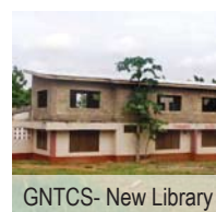
GNTCS- New Library