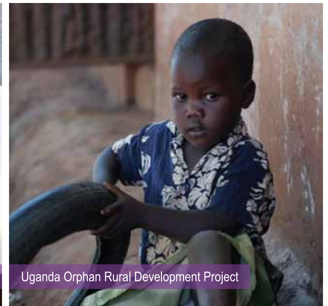
Uganda Orphan Rural Development Project