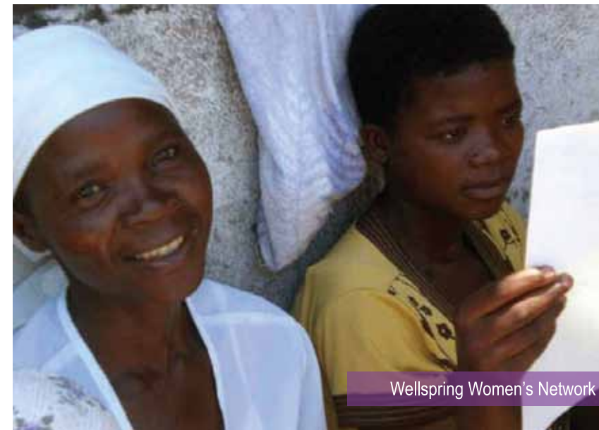
Wellspring Women's Network